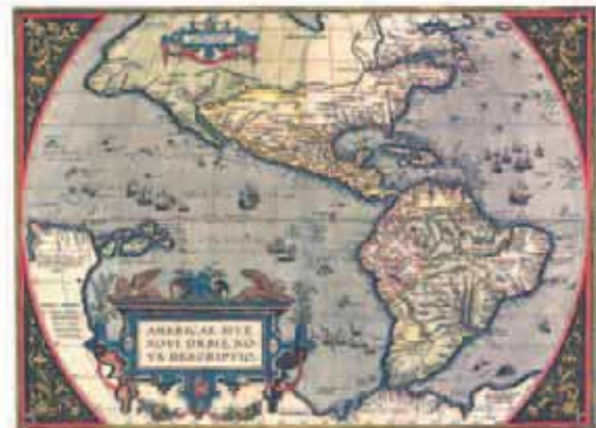
Above: An old map may be the starting point for a lifetime's quest for lost or hidden treasures

Another attraction is the mystery of treasure stashed away and never recovered, for example, pirate gold. Stolen after years of careful planning or taken on the spur of the moment, the treasure had to be concealed and the pirates' tracks covered before it could be retrieved and enjoyed. Often misadventure overtook the pirate before he could return, yet somehow the details of the treasure were passed on, shrouded in ever-greater secrecy.