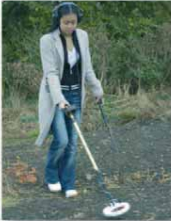
Left: Metal-detecting – one of the more popular forms of treasure-hunting

Two emotions motivate the majority of treasure-hunters. One is the desire to get rich quick: the same feeling that drives people to bet on sporting events or buy lottery tickets, week after hopeless week. This is generally not greed: more the fulfilment of dreams. Who does not wish to be rich? Treasure-hunters sometimes do strike lucky, just as some people win the lottery, but often the time, effort and money invested are greater than the material rewards. So why do it? Probably because of the excitement.