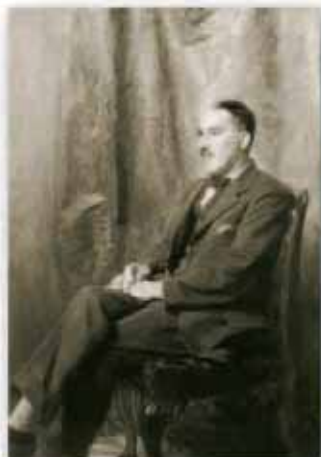
Above: Howard Carter

A t first I could see nothing, because the hot air escaping from the burial chamber caused the candle flame to flicker. Presently, however, as my eyes grew accustomed to the light, details of the room within emerged slowly from the mist: strange animals, statues and gold – everywhere the glint of gold.