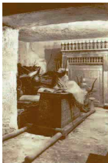
Above: The entrance to the treasury